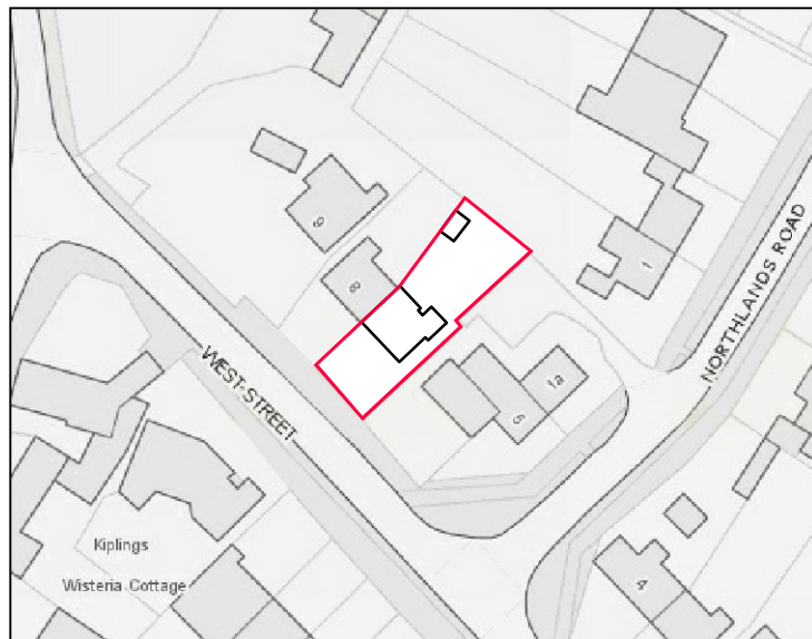
EXISTING SITE LOCATION PLAN 1:2500